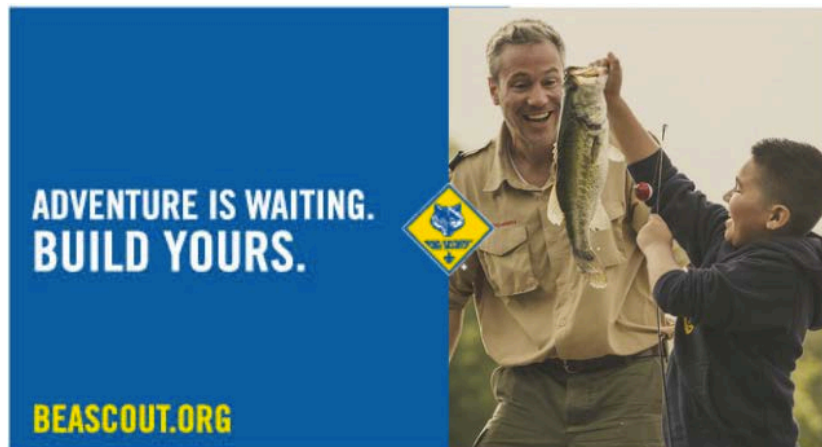
Front of card

Fillable PDF templates are available on the Council website in the membership resources tab. http://www.cnyscouts.org/membership/